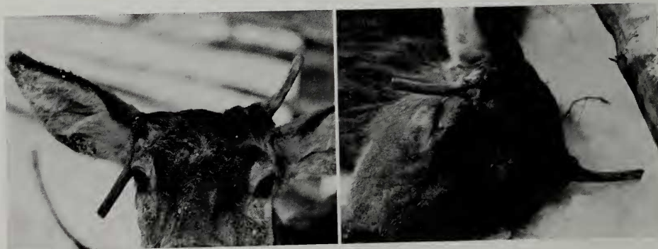
Fig. 9 (left) and Fig. 10 (right). Red deer stag Fernando on February 23rd, 1965

The most important data concerning the antlers of Puchatek are collected in Table 3. Grafting in this case was without results. In this case it is interesting, that the tearing off of the left antler in 1963 preceded the improvement of its regeneration. It is also interesting that the regeneration of the right antler commenced only in the fourth antler cycle after the operation.